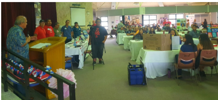
Congressional office hosts Veterans Resource Fairs. More than 150 veterans, servicemen and women, and their family members, along with over 30 service providers, took part in the first-ever Veterans Resource Fairs on Saipan, Tinian and Rota in February. The congressional office hosted the Fairs, bringing federal and local veteran service organizations together in one place, to help veterans connect with the many resources available to them.