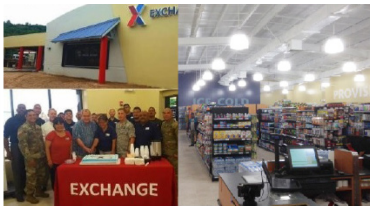
The bigger, better AAFES troop store opened in August.

All honorably discharged veterans also have access to online exchanges. Learn more at www.militaryonesource.mil/commissary-exchange .