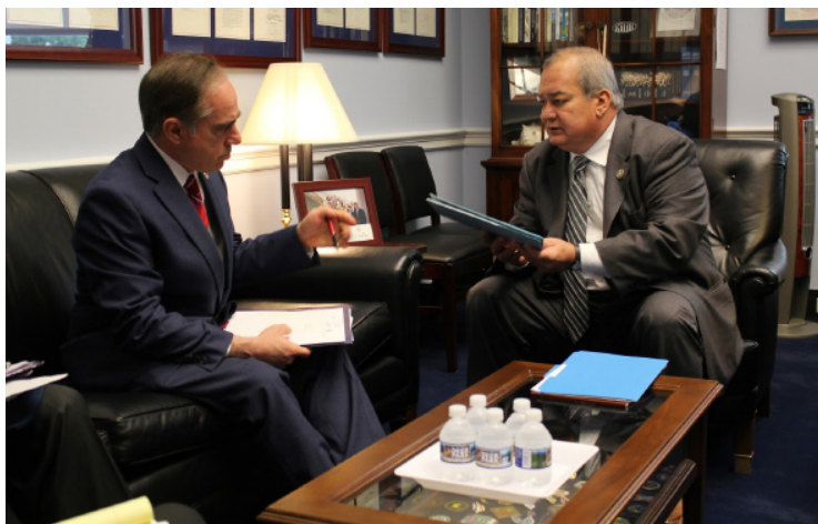
Congressman Sablan briefs Dr. David Shulkin, Secretary of Veterans Affairs, on the difficulties Northern Marianas veterans have accessing health care and the other benefits earned through their service.